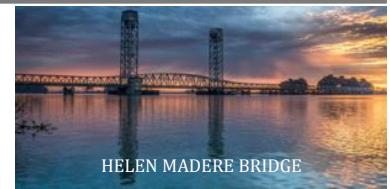
HELEN MADERE BRIDGE

No one has ever become poor by giving—Anne Frank