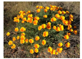
Wild California poppies by the sewer treatment plant

I have kleptomania, but when it gets bad, I take something for it. ~ Robert Benchley