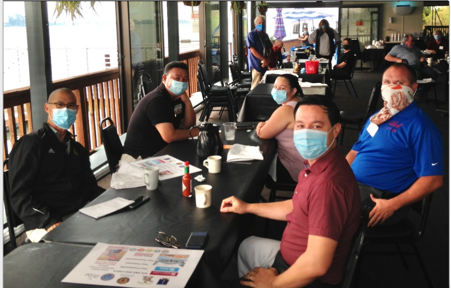
Forewarned is forearmed: Rotarians above demonstrate proper pandemic prophylaxis. Subjects in photo below were photographed prior to the face mask alert.