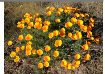
Wild California poppies by the sewer treatment plant

"What one person receives without working for, another person must work for without receiving." ~Thomas Jefferson