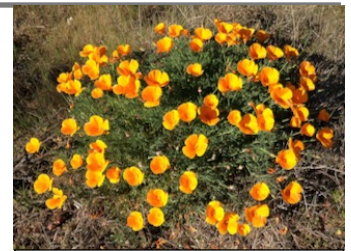
Wild California poppies by the sewer treatment plant

There is no rose without thorns. ~Mexican proverb