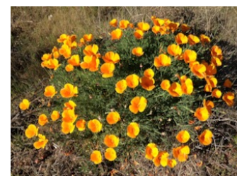
Wild California Poppies

"Lord, keep Your arm around my shoulder and Your hand over my mouth!" ~ Anonymous