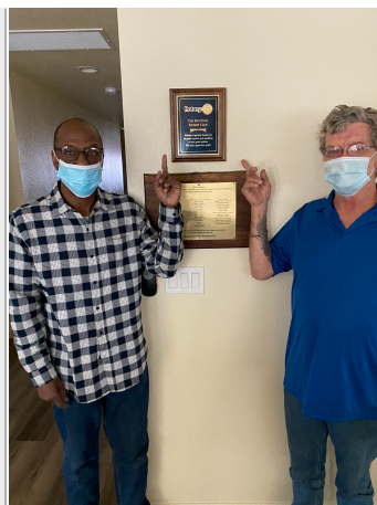
New residents in vet's home appreciate their new TV as they point to commemorative plaque from our club.