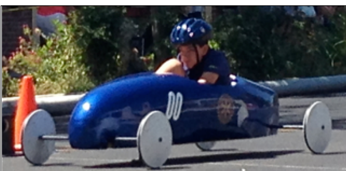
Avid young racer puts newly painted Rotary Soap Box Racer through its paces; Rio Vista Ford donated paint job.