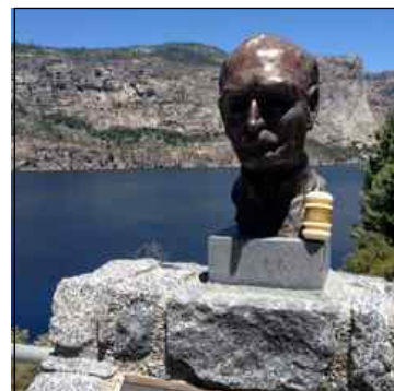
Neither rain, snow nor man made dams will keep me from my president.