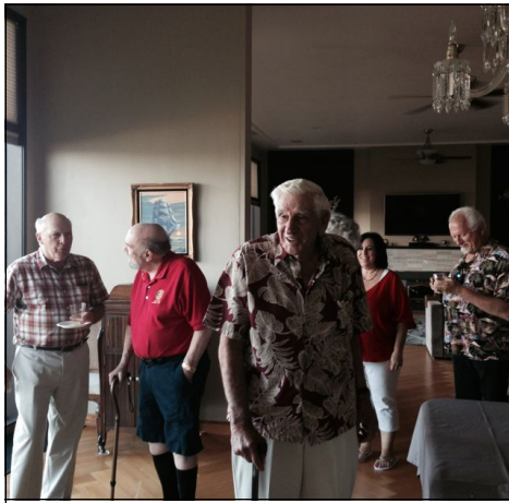
Let the games begin.