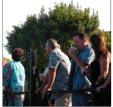
There he goes!