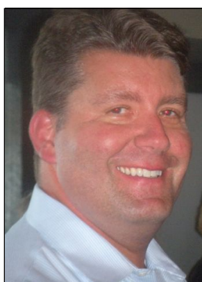
I am never going to lose the gavel!