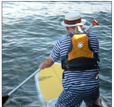
I'm on my way!