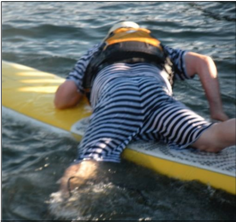
I know I can...