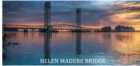
HELEN MADERE BRIDGE