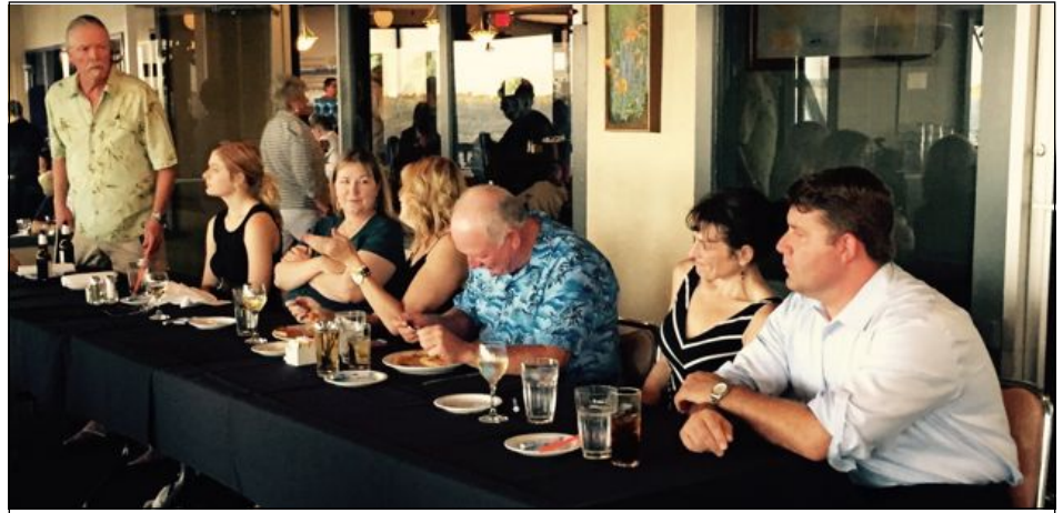
The head table