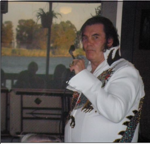
Elvis is in the house.