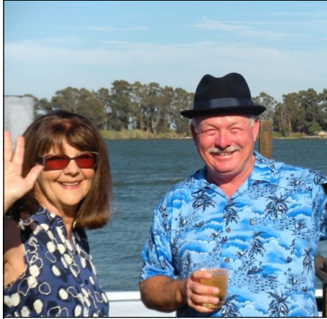
Enjoy it while you can, Mr. President.