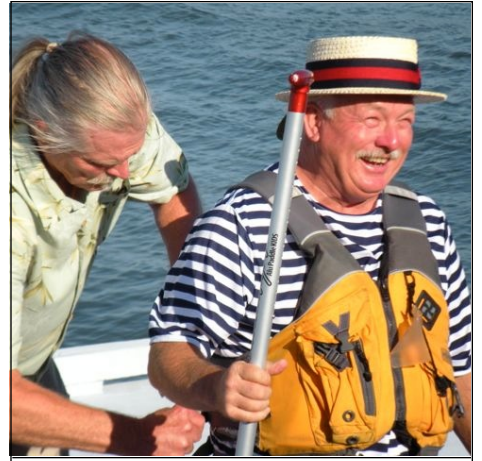
This is going to be fun!