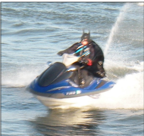
Batman to the rescue!