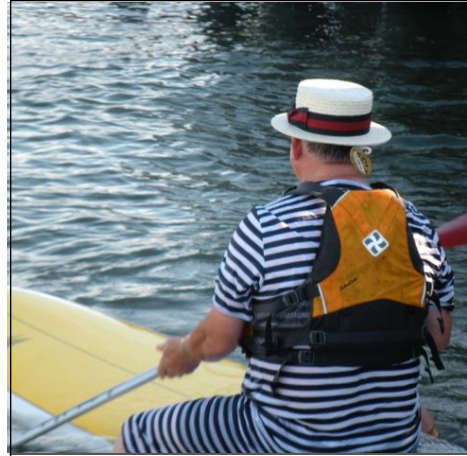
This is going to be a piece of cake...