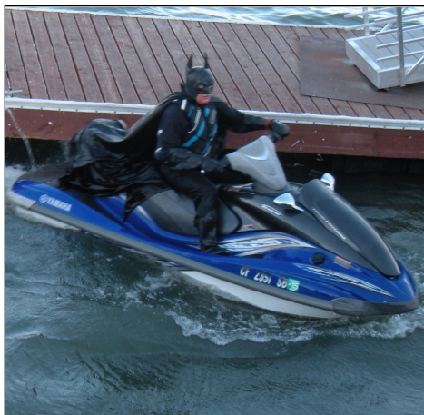
Holy diversionary tactics-Craneman?