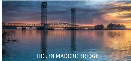
HELEN MADERE BRIDGE

"It's tough to make predictions, especially about the future." — YOGI BERRA