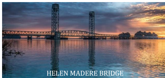
HELEN MADERE BRIDGE

Never grow a wish-bone where a back-bone ought to be.