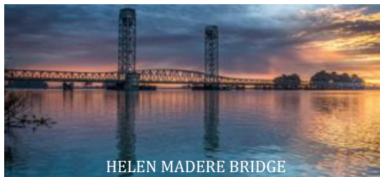
HELEN MADERE BRIDGE