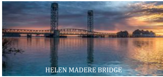
HELENE MADERE BRIDGE

"Once a man holds public office he is absolutely no good for honest work." —WILL ROGERS