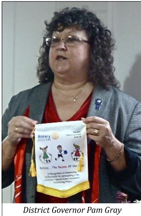
District Governor Pam Gray