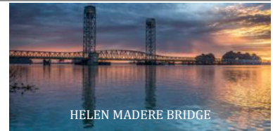
HELEN MADERE BRIDGE

"A good speech should be like a woman's skirt: long enough to cover the subject and short enough to create interest." -Winston Churchill