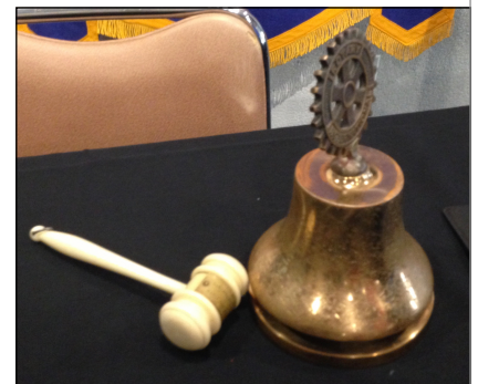
The gavel and bell are now in Lee's possession...but probably not for long.

Fire damage, June 18, shut down a huge area around lake Berryessa, yet the power was restored in 14 hours.