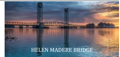
HELEN MADERE BRIDGE