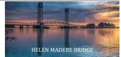
HELEN MADERE BRIDGE

"Where the people fear the government, you have tyranny. Where the government fears the people you have liberty." -Thomas Jefferson