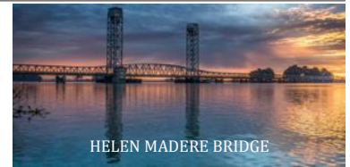
HELEN MADERE BRIDGE